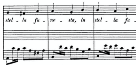
Ex. 4.2.2: "Pupilla lucente" from Chi rapì la pace?