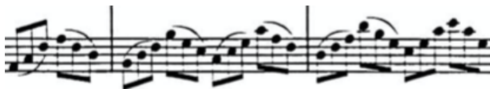
Ex. 4.7.2: "Ride il fiore in seno al prato" from Nella stagion