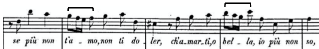
Ex. 3.11.2: "Se più non t'amo" from Stanco di più soffrire

The sixteenth-note decoration is classified as a passing appoggiatura since, by referencing the parallel design in the voice part on the words "t'amo" and "bella" (Ex. 3.11.2), it gravitates and connects to the following eighth note to form a unit. The ornament enlivens the expression of the self-pitying lover.