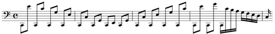
Ex. 6: Excerpted from Gabrielli's Ricercar No. 5