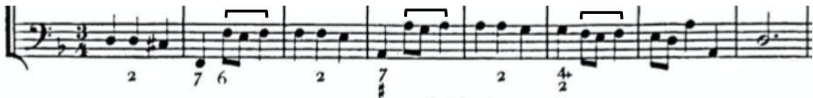
Ex. 2.8: "Son pur le lacrime" from Figli del mesto cor

Son pur le lacrime Tears are still Il cibo misero The wretched food Ch'io prendo ognor. That I always take. Sempre tra gemiti Always groaning, Non spiro altr'aere I breathe no other air Che del dolor. Than that of sorrow.