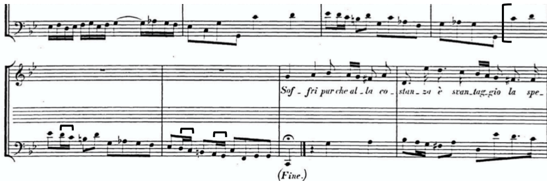
Ex. 3.12: "Sì bel foco è quel che t'arde" from Non sospirar

Such beautiful desire is that which enflames you, So that you cannot be sad, O heart. Yet you suffer because hope Is a detriment to constancy When a beautiful passion is glorious.