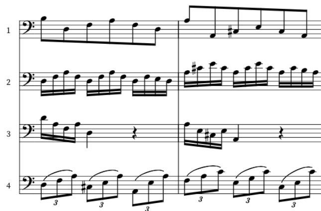
Ex. 4.19: Samples of broken-chord figures in Corelli's Op. 5, Folia

The same design could perhaps be used to substitute the broken-chord pattern in "Se pari è la tua fè" as a symbolic representation of "faithfulness" (Ex. 4.21). By further embellishing it with passing notes, the changes can be more easily noticed by the listeners, and therefore fulfilling the purpose of variation.