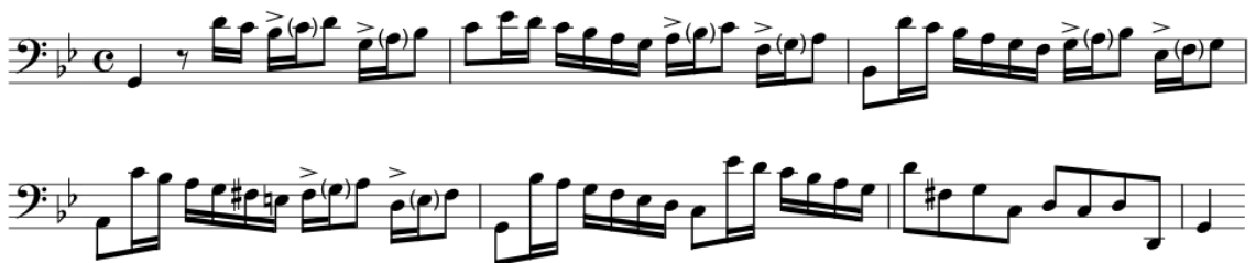
Ex. 1.20: "Forse che un giorno" from Aminta e Fillide (embellished)

Perhaps one day the god of love may give your heart a wound which will be fatal; How lovely then to gaze upon you languishing and grieving, suffering the stinging wounds of a sharp arrow. 27