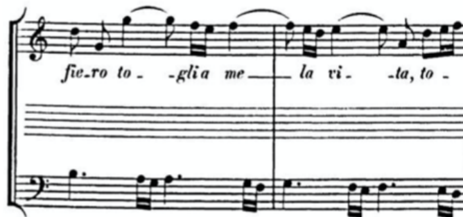
Ex. 2.18: "Pria che spunti un dì sì fiero"

The only exception that contradicts C. P. E. Bach's theory that mordents should "never [be] on descending steps of a second" is the decorated descending passage in "Pria che spunti un dì sì fiero," where the m-figures facilitate the interlocking suspensions between the voice and the continuo (Ex. 2.18). For easy reference, a graphic summary of the intervallic and directional tendencies of the notes that precede and follow the m-figure is presented in Examples 2.19.1 and 2.19.2.