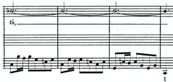
Ex. 4.2.1: "Pupilla lucente" from Chi rapì la pace?

Pupilla lucente The shining eye[s] In stella funesta, Love changed Amore cangiò. Into a fatal star. Così quel splendore, Thus that splendor Con empio rigore With pitiless severity La morte additò. Pointed to death.