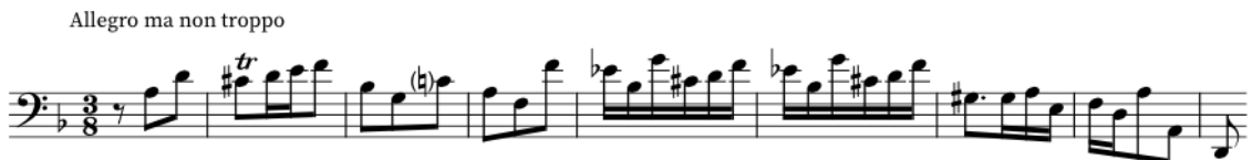
Ex. 3.17: "S'altri gode pensando al suo bene" from Qualor l'egre pupille (embellished)

Il bosco, il prato, il rio, The wood, the field, the river, Di te, caro ben mio My dear beloved, L'immagine adorata Carry back the adored image Riportano al pensier. Of you to my thoughts. E se zampilla il fonte And if the fountain gushes forth, Mi par di star à fronte I seem to stand in front of De lumi tuoi vivaci Your sparkling eyes E del tuo guardo arcier. And your dart-like glance.