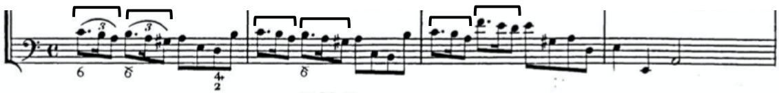
Ex. 1.11.1: "Sì, piangete, O mie pupille" from Lungi n'andò Fileno

Yes, weep, O my eyes, And at the sound of your tears Let my heart respond with sighs. And let resound in plaintive echo, In every cave, in every cavern, My suffering and my sorrow.