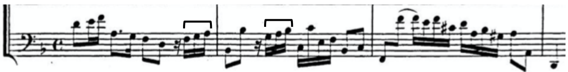
Ex. 1.3.1: "Figli di rupe alpestra" from Poiché giuraro amore

Offspring of the rugged cliff, Hard stones, Your fate will change Perhaps one day. A divine hand will give you Strength, spirit and valor That will release you from The fury of time and death.