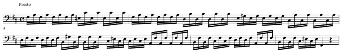
Ex. 1: "Infante volante" from Bononcini's Cieco Nume, tiranno spietato

The following excerpt, which shows the continuo introduction in the aria, "Infante volante" from Bononcini's cantata, Cieco Nume, tiranno spietato , 4 presumably demonstrates the type of brilliant bass that Gasparini had in mind: