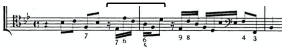
Ex. 4.1.2: "Chi rapì la pace al core?" from Chi rapì la pace?