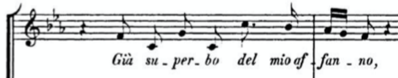
Ex. 1.8.2: "Già superbo del mio affanno" from Lucrezia ("O numi eterni!")