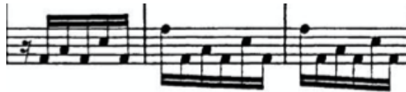
Ex. 4.3: "Non le scherzate intorno" from Udite il mio consiglio

Do not joke around her, Because she will set your heart on fire. And when you ask for pity For your engendered passion, She will say that in her heart She has not a droplet of love.