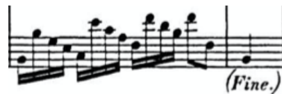
Ex. 4.1.1: "Chi rapì la pace al core?" from Chi rapì la pace?

Who stole peace from my heart? Who robbed the soul from my breast? Ah! I know, With a dart-like glance The blind god wounded me.