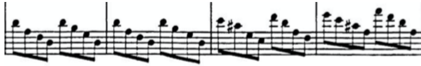
Ex. 4.11: "Voglio darti a mille a mille" from Quando sperasti

The half-bar harmonic rhythm, expressed through the descending arpeggios in the continuo, is juxtaposed against the 4/4 meter in allegro tempo to capture the protagonist's passionate feelings towards Fille.