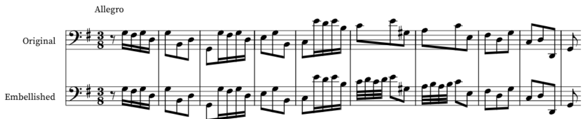
Ex. 3.18: "Bella gloria in campo armato" from Solitudini care (embellished)