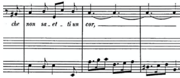
Ex. 1.1.2: "Non esce un guardo mai" from Udite il mio consiglio

The passing note is commonly used within the siciliano context. It provides a melodic component to the bass, and is put into play when the voice holds a long note (Ex. 1.1.2). Paired with the text, in this example it helps to convey the protagonist's fervent admiration towards the "simple girl." 20