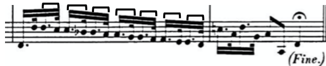
Ex. 3.3.1: "Un affanno più tiranno" from Lungi da voi

An anguish more tyrannical Than cruel distance, Cannot be found and does not exist. And my heart, that dies away, Can say again, how much her fierce cruelty Increases it.