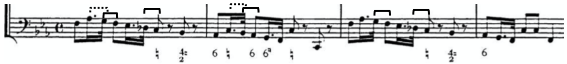
Ex. 3.13: "Un sospir a chi si muore" from Un sospir

One sigh to one who dies, For pity's sake, O lovely lips, Will give this heart An agony less painful.