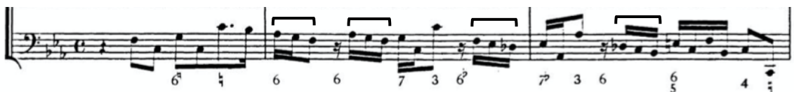
Ex. 1.8.1: "Già superbo del mio affanno" from Lucrezia ("O numi eterni!")

Already exulting in my suffering, The betrayer of my honour, Wicked and faithless, takes his leave. Oh, punish the arrogant deceit Of this traitor, this evil monster, Just heaven, O deadly Fate!