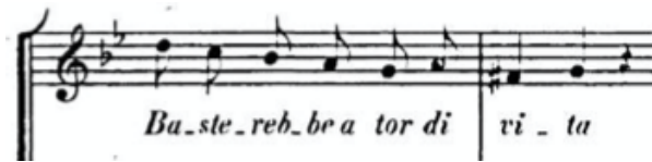
Ex. 1.10.2: "Basterebbe a tor di vita" from Poiché giuraro amore

The dotted rhythm shown is written only in the beginning ritornello. The other occurrences of the descending scalar motion in the main body of the aria are written in even eighth notes. Rather than classifying the bracketed non-chord note as a passing appoggiatura, the passing note rendition makes a smoother phrase that corresponds to the natural delivery of the line, "Basterebbe a tor di vita" (Ex. 1.10.2). 23