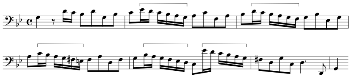
Ex. 1.19: "Tormentosa crudele partita" from Parti, l'idolo mio