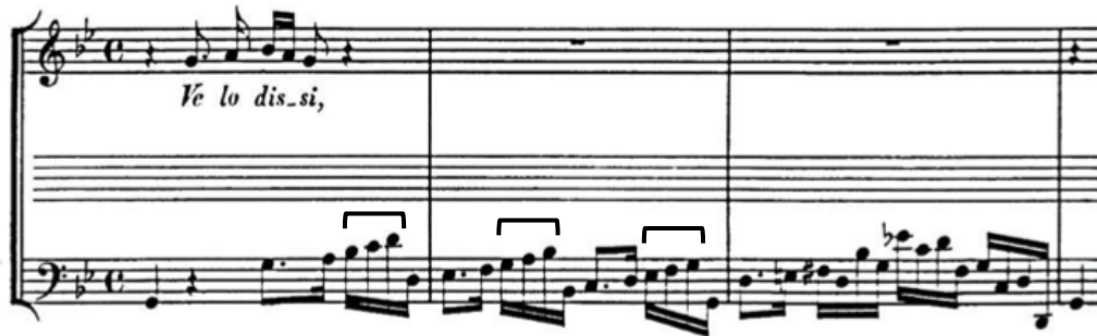
Ex. 1.2: "Ve lo dissi, e nol credeste" from Occhi miei

The bracketed ascending three-note gesture is especially interesting in this case since it opposes the descending contour used in the vocal theme, as if to indicate the subject's—"you" ("my eyes")—blind admiration for Fille. 21