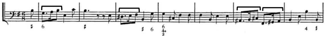
Ex. 1.1.1: "Non esce un guardo mai" from Udite il mio consiglio

Non esce un guardo mai Never does a look depart Da quegli arcieri rai, From those shooting rays, Che non saetti un cor. That does not wound a heart. E'l cor che vien colpito, And the heart that is hit, Si sente già ferito Already feels wounded Che non lo crede ancor. When it still believes it not.