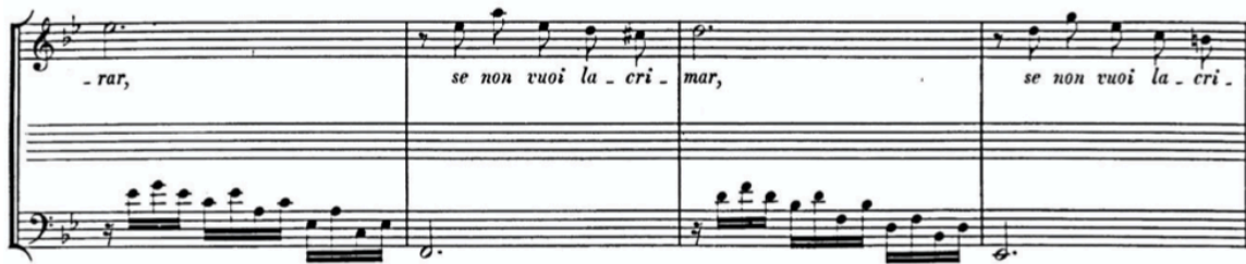
Ex. 4.8: "Lascia di più sperar" from Menzognere speranze

Lascia di più sperar Leave off hoping Se non vuoi lacrimar, If you do not want to weep, Povero core! Poor heart! Non usar fedeltà, Do not practice fidelity, Vanta sol crudeltà, Value only cruelty, Se brami trionfar If you desire to triumph over Del Dio d'amore. The god of love.