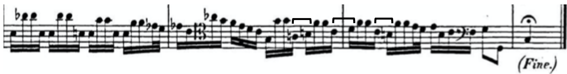
Ex. 3.10: "Se al pensier dar mai potrò" from Sarei troppo felice

If I can ever give to my thoughts, As I do to my feet, law and measure, My heart will enjoy peace. I will go far from the unfaithful one, But then worse pain I fear, O God! will ensue.