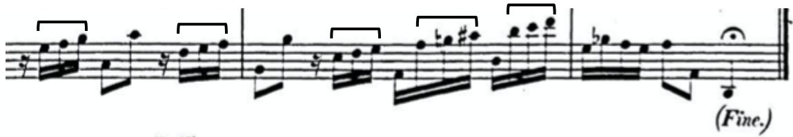
Ex. 1.3.2: "Figli di rupe alpestra" from Poiché giuraro amore

The three-note pick up in the continuo introduction (Ex. 1.3.1) is used throughout the aria to set a hopeful tone, and is presented in a compact form at the end of both the A and B sections (Ex. 1.3.2 shows the closing ritornello).