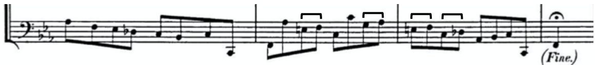
Ex. 3.2: "Crude stelle! Astri tiranni!" from Se per fatal destino

Cruel stars! tyrannical planets! Counsel me to die, Or lead me gently away If persistent is my fear. Teach the loving heart The reason for a noble courage, Or at least in pity, tell My beloved of my pain.