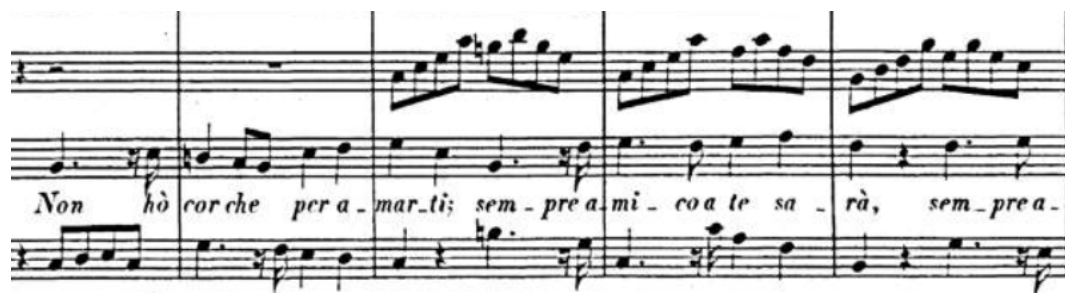
Ex. 4.20: "Non hò cor che per amarti" from Agrippina