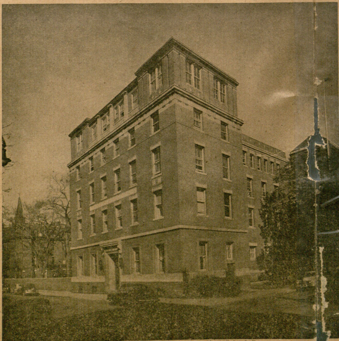
Old Evans, Now Building A of Medical School Group

At present Selective Service regulations permit the deferment of premedical students who are certified by their college, accepted by a medical school and approved by the National Roster of Scientific Personnel in Washington. It is expected and hoped that a fair number of highly qualified premedical candidates will take advantage of this opportunity for continuing their medical training. The certification through the National Roster, which is under the direction of the War Manpower Commission, serves to remove any stigma of evasion of duty from such candidates. They are continuing in Medicine with the full approval of the Manpower authorities and with the full understanding that a steady flow of men trained for the medical profession is essential to the prosecution of the war.