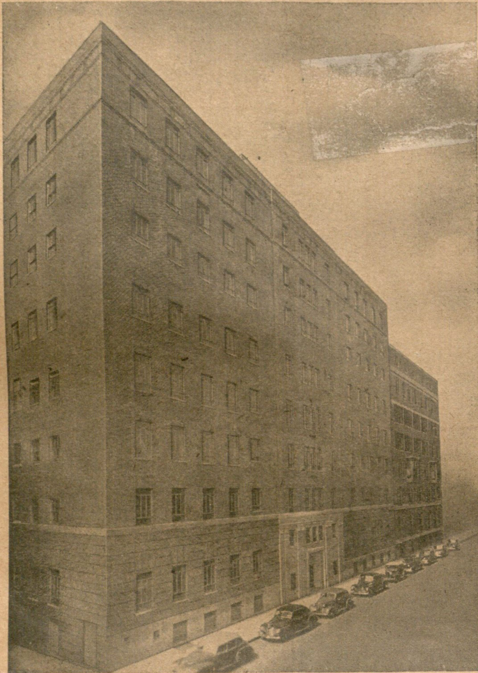
Newton Street View of the New Evans Memorial Hospital

Thus through the foresight of the Hospital and University Trustees the School is doubly blessed in that its teaching facilities, both clinical and preclinical, have been greatly enlarged and improved. In spite of this we are faced with a great many needs to do away with obsolescence and provide adequate research and teaching laboratories as well as proper class rooms. We badly need a new building. The housing of animals is a problem particularly acute in as much as they now have to be kept in space that should be otherwise assigned. It is impossible to say that our plant has not been greatly improved in the last two years, but this should not lull us into a sense of smug security and self-satisfaction.