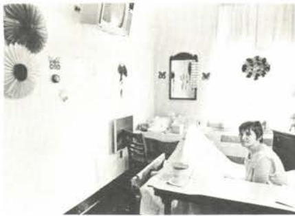
A gallant young girl on Evans 3, who will be with us as a long-term diabetic patient, is proud of her beautifully decorated room. Friends and family have combined to turn her room into a gay and loving demonstration of those who think of her while she is in our University Hospital care.