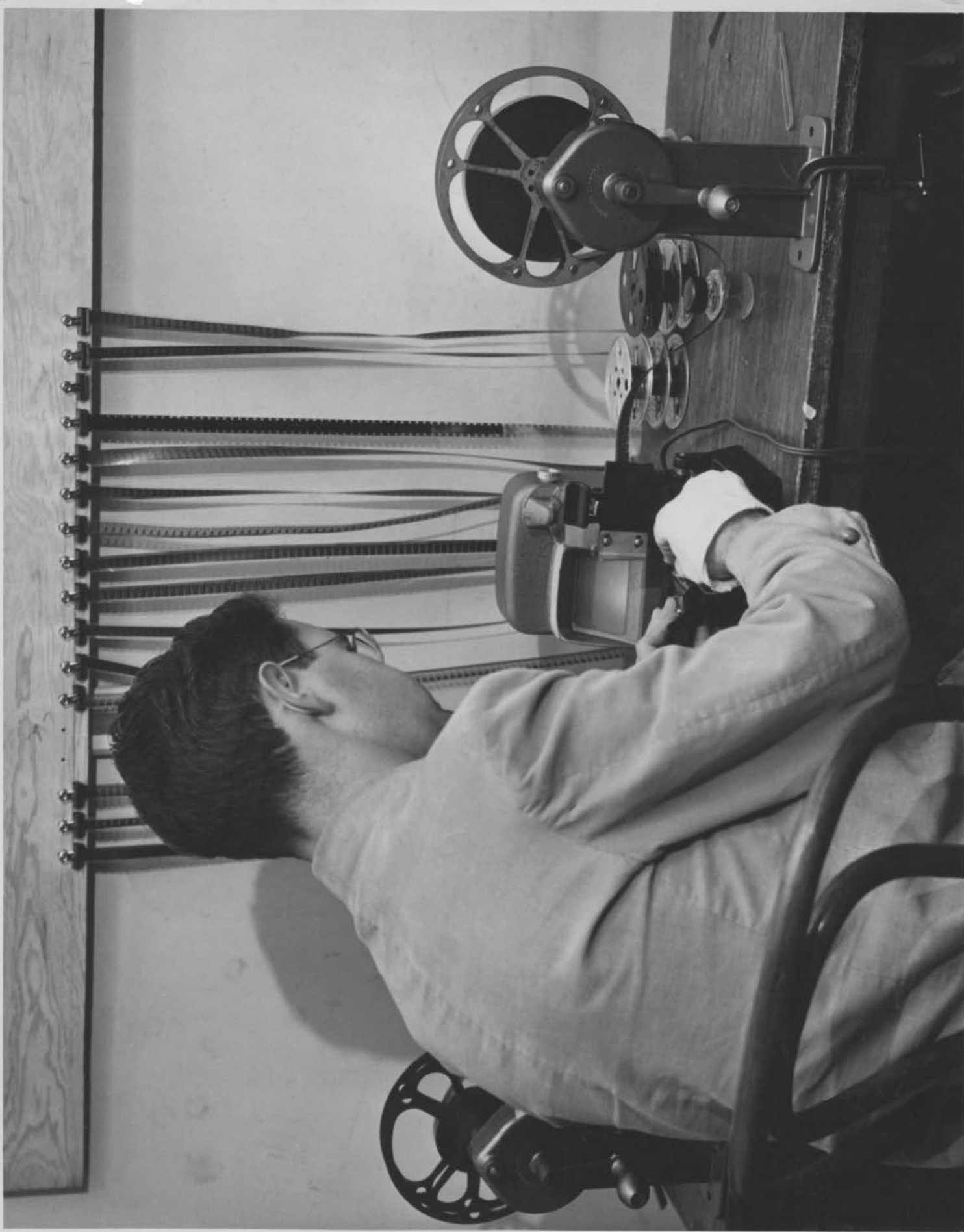
Fig. 27. A typical nonprofessional editing setup