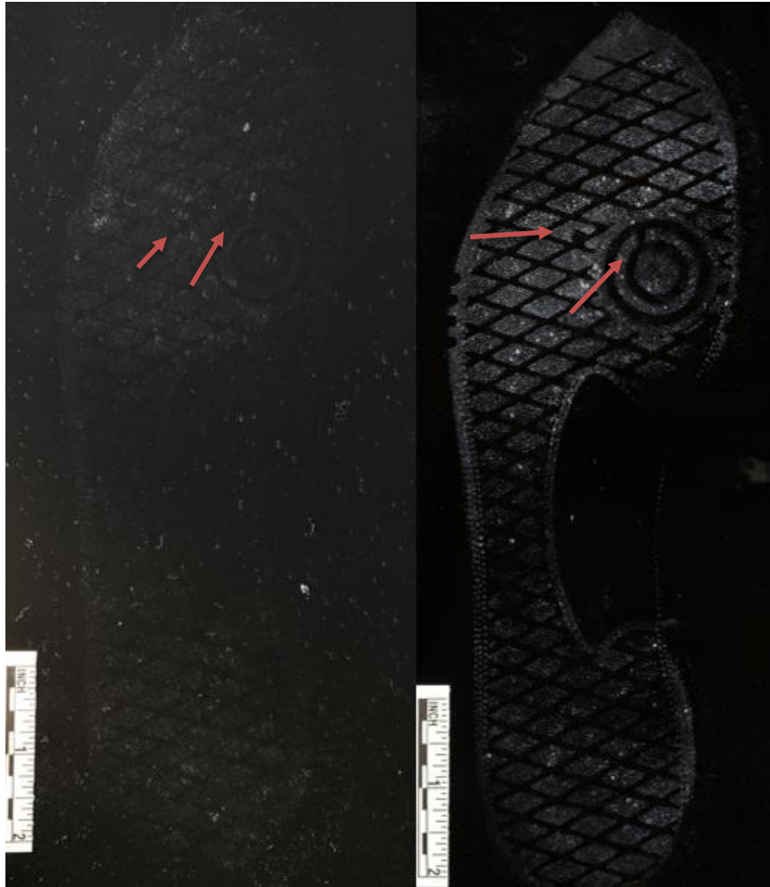
Figure 4. Side by Side RACs on lift comparison (Left: Stat-Lift™, Right: Gelatin Lifter)