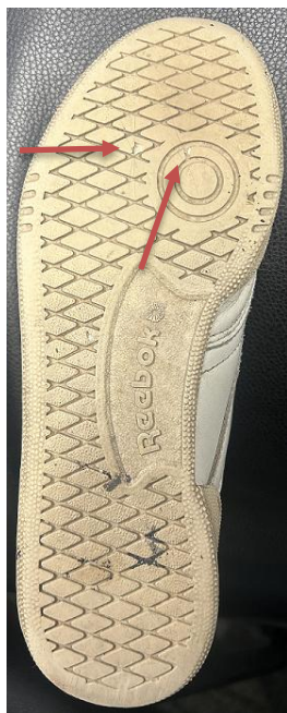
Figure 1. Outsole Pattern of Selected Shoe with RACs