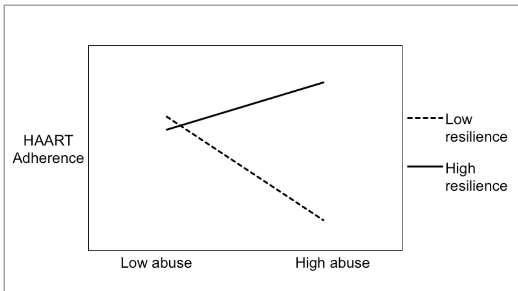
Figure 3.1 Regression lines for associations between abuse composite and HAART adherence as moderated by resilience.

Note: HAART= Highly active antiretroviral therapy. Low/high abuse refers to low/high abuse composite score summing all three types of abuses.