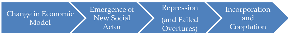
Figure 2 Historical Evolution of New Social Actors

The historical trajectories of the labor and piquetero movements exhibit remarkable similarities. Generally, the path of either group can be described in the following manner: a change in the economic model reshuffled class relations and gave rise to new economic and social conditions. As a result, a new social class emerged and organized to champion its interests. Given the novelty and perceived extremism in the movement's methods, the state responded with repression, resulting in violent clashes. Timid overtures were attempted, but ultimately failed to establish a modus vivendi . Finally, the movement underwent incorporation thanks to the efforts of a personalistic leader seeking mass support to consolidate his position. Figure 2 depicts this model.