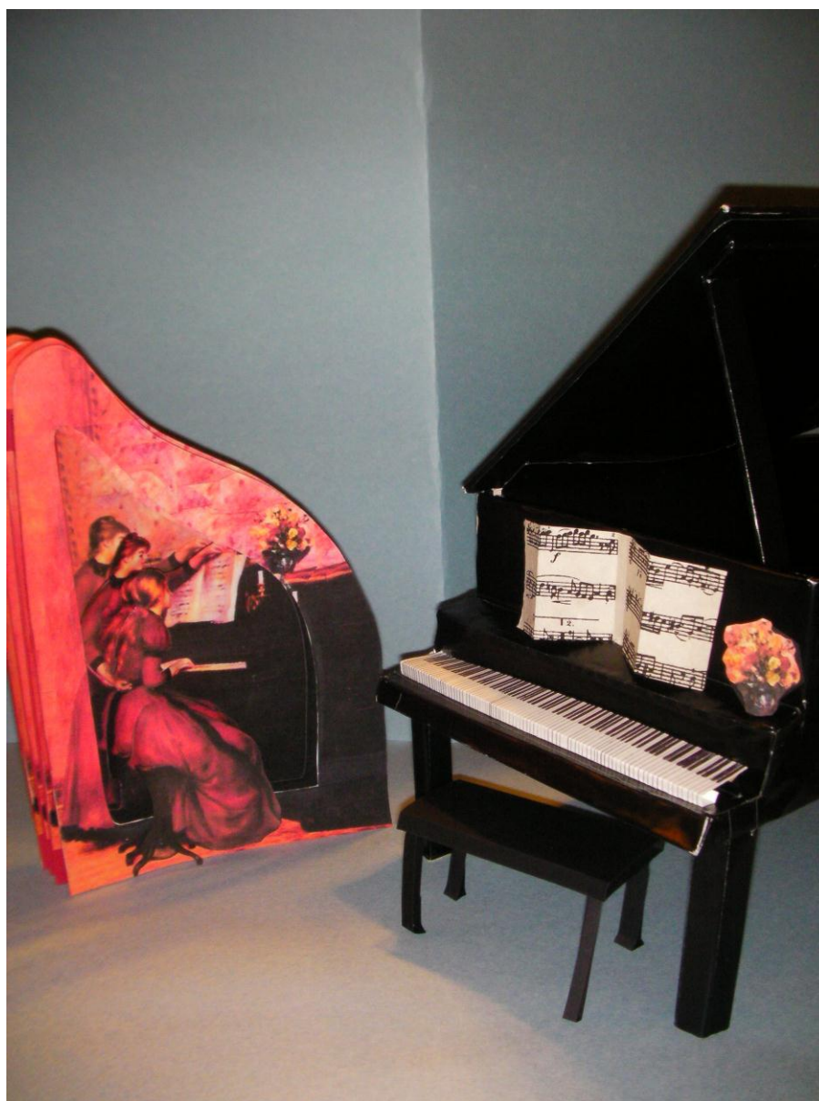
“The Piano Lesson”, Pierre Auguste Renoir