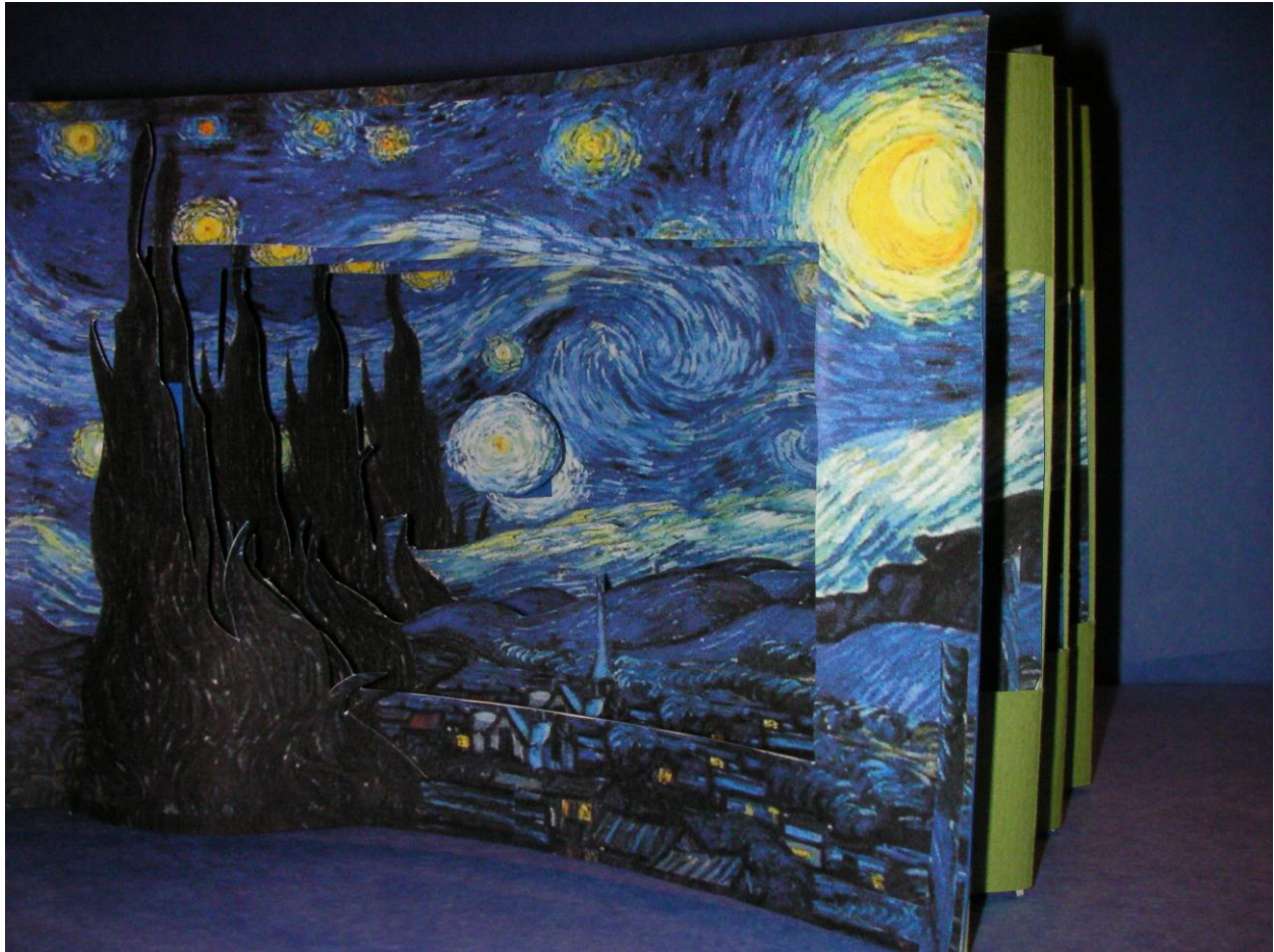
“Starry Night”, Vincent Van Gogh