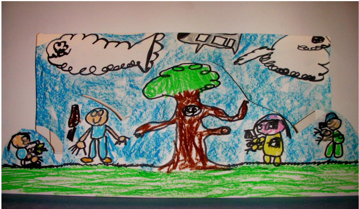
Figure 8. A Student Tunnel Book, “My Family and Me”