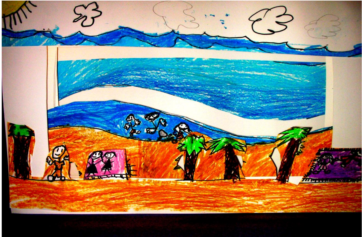
Figure 5. A Student Tunnel Book, “A Day at the Beach”