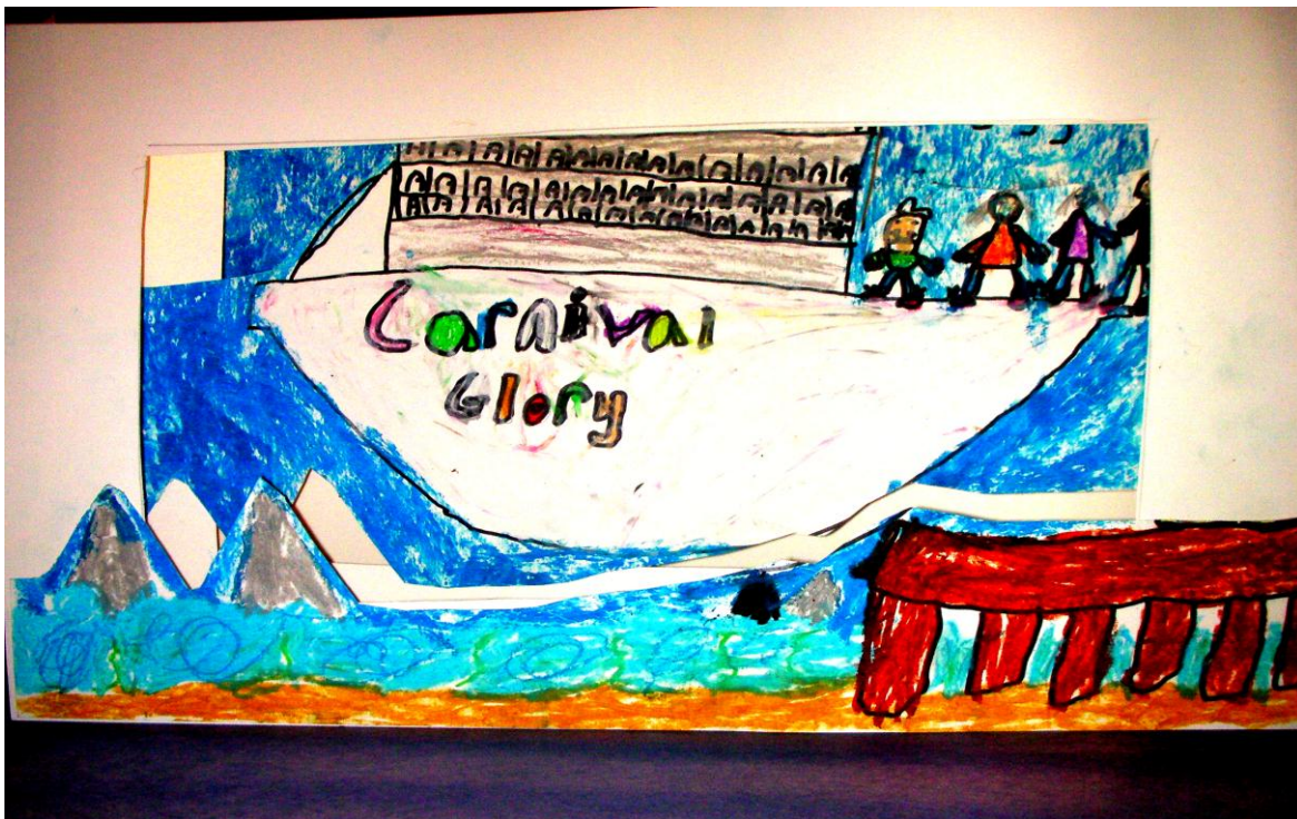
Figure 6. A Student Tunnel Book, “My Family Cruise”