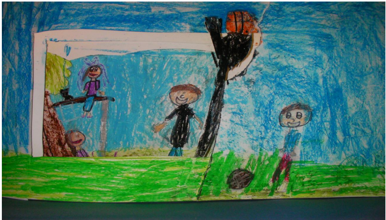
Figure B. 13 Photograph of student family portrait tunnel book, “Saturday with Family”