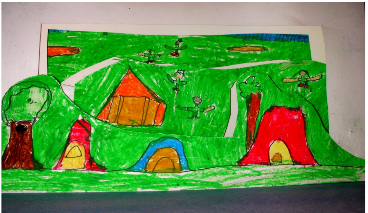
Figure 9. A Student Tunnel Book, “My Family Campout”