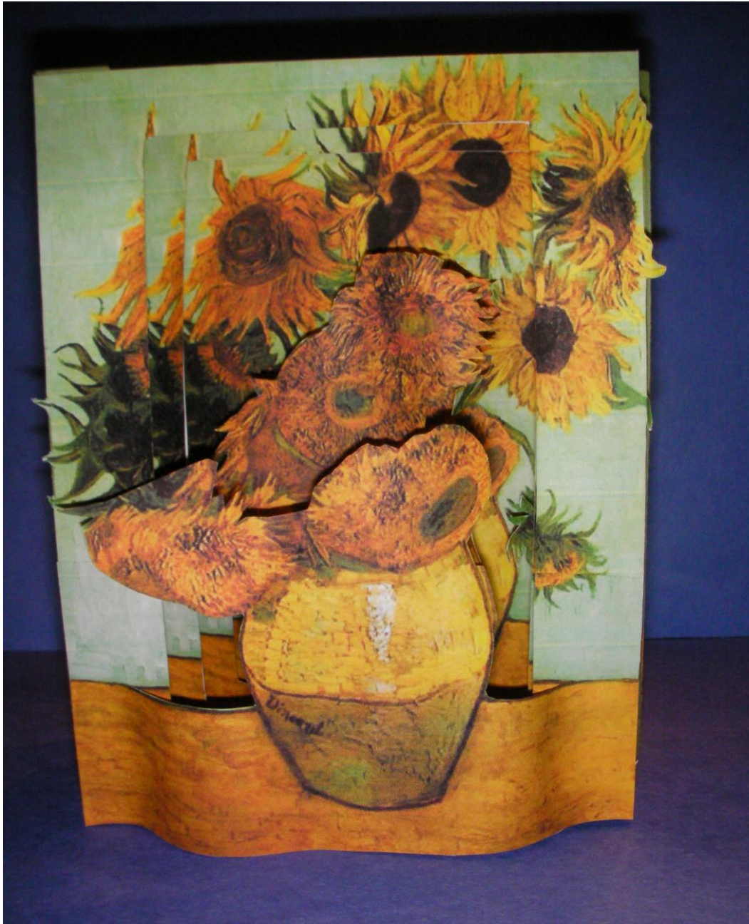
“Sunflowers”, 1888, Vincent Van Gogh