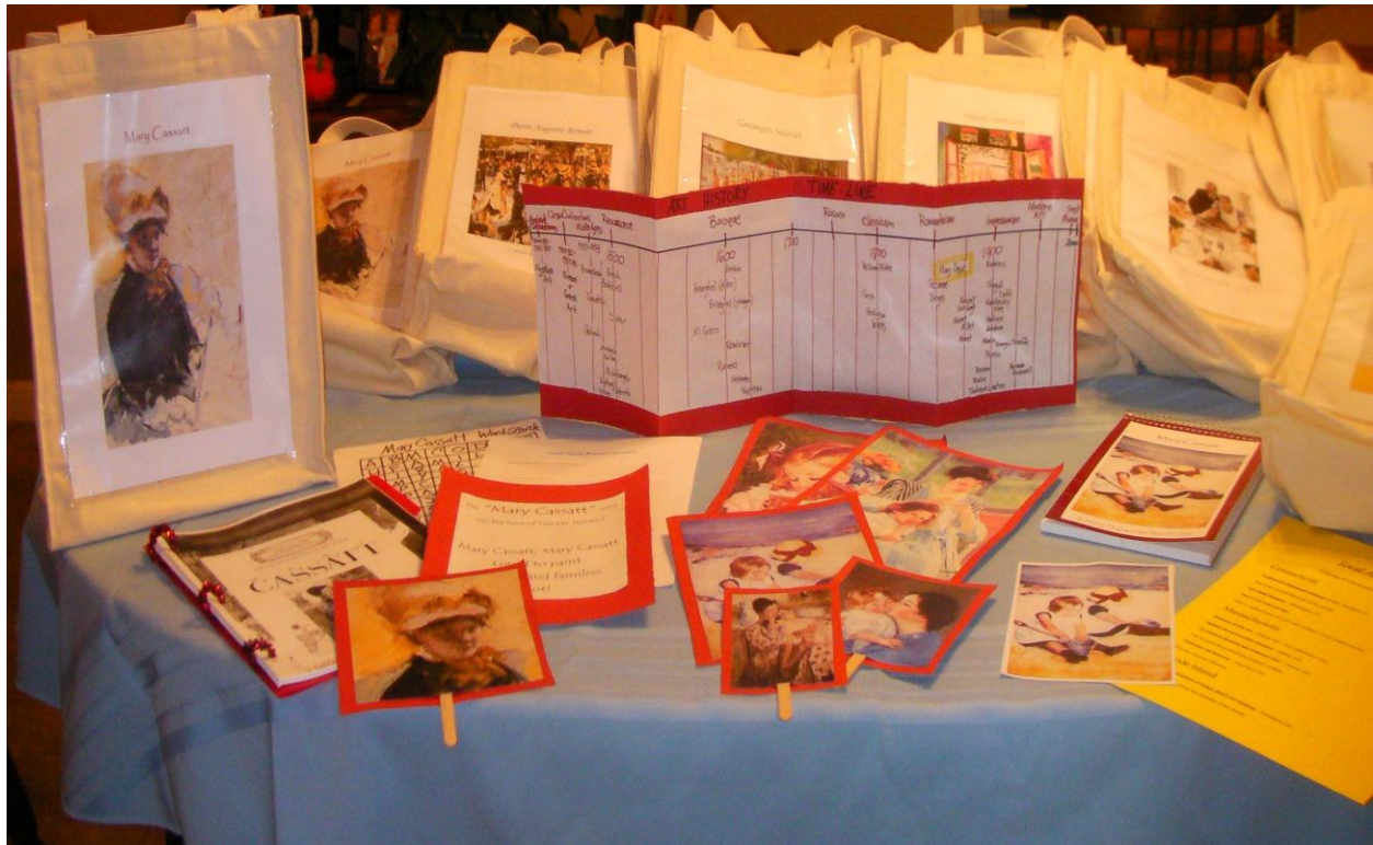
Figure 4. A display of the Mary Cassatt Activity Bag contents