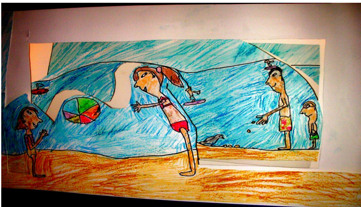
Figure 7. A Student Tunnel Book, “Family Fun in the Sun”