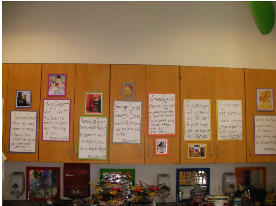
Figure B.1 Photograph of Song Posters