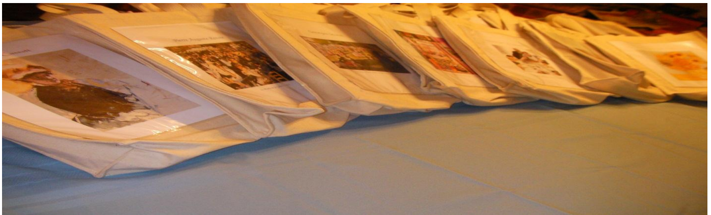
Figure 3. A display of the Activity Bags, “From Cassatt to Van Gogh”