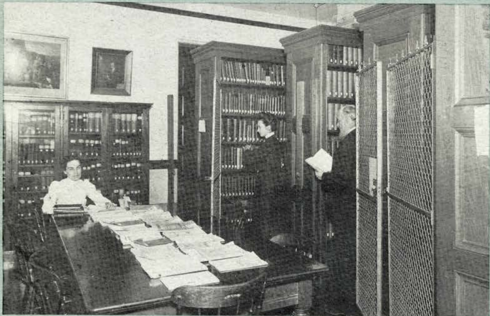
"A Corner in the Library"

This picture, captioned "A Corner in the Library," appeared in the 1904 Boston University School of Medicine catalog.