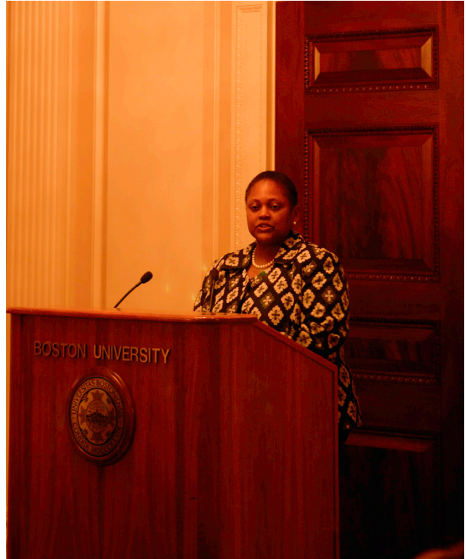
Assistant Secretary Frazer gives a keynote lecture at the conference's closing dinner.