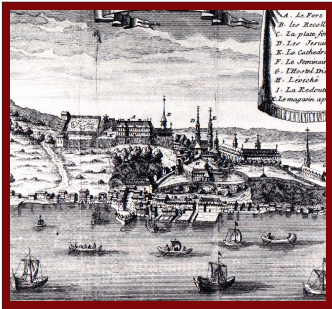
Quebec Nouvelle France.

laws and ways of life, which were revolutionary concepts for the time. All of this, however, was anchored firmly in reality by the lack of representation that prevented people from making their voices heard. All of this portrays the British as upholding an imperial autocratic system with selective tolerance, which importantly failed to dominate the Quebec brethren to the extent that would be outlined by the ideas of Antonio Francesco Gramsci. This may be related to English being a minority language in the province they ruled. The Quebec Act serves as a poignant example of a colonial paradox: an empire that oppressed millions yet carved out an island of cultural pluralism in Quebec, reminding citizens of today's modern world that the seeds of identity can still be sown in the shadows of authoritarian power.