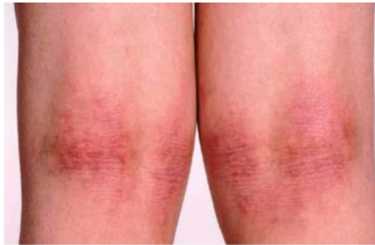
Figure 2. Atopic dermatitis lesions with lichenified plaques affecting the antecubital fossae. 19

Atopic dermatitis affects genders equally and is one of the most commonly diagnosed dermatological disorders in adolescents. According to the 2003 National Survey of Children's Health, the incidence of atopic dermatitis is around 1 in 5 children, with a prevalence varying between 8.7 – 18.1% across states. After analyzing the national survey, Shaw et al. stated an odds ratio of 1.67 for correlative relationships between AD and factors such as metropolitan living, black race, higher education level, and dry climates. 1 Other correlations include black race, higher education level, and dry climates. In comparison, atopic dermatitis affects 15-20% of children and 1-3% of adults worldwide. 18 The incidence of atopic dermatitis is increasing; during past decades in several industrialized nations, the incidence has increased up to 3 times. Living in developed countries and metropolitan regions seems to be a risk factor for AD. Although the prevalence of AD is higher in developed countries and metropolitan regions, efforts to