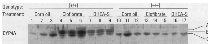
Figure 3. Evaluation of DHEA-S induction of liver CYP4A proteins expression in PPAR \alpha (+/+) and PPAR \alpha (-/-) mice. Western blot analysis of liver microsomes P4504A protein using anti-4A antibody. Microsomes were prepared from liver samples corresponding to the samples shown in A. P450 4A-immunoreactive proteins marked A and B are induced by clofibrate and DHEA-S, but only in PPAR \alpha (+/+) mice, whereas band C corresponds to a constitutively expressed protein that is unaffected by the gene knockout.

(Figure 3). These results are consistent with Northern blot results showing strong increases in the hepatic mRNAs encoding CYP4A1, CYP4A3, acyl-CoA-oxidase, bifunctional enzyme, and 3-ketoacyl-CoA thiolase in PPAR \alpha (+/+) mice but not PPAR \alpha (-/-) mice after DHEA-S and clofibrate treatment (22).