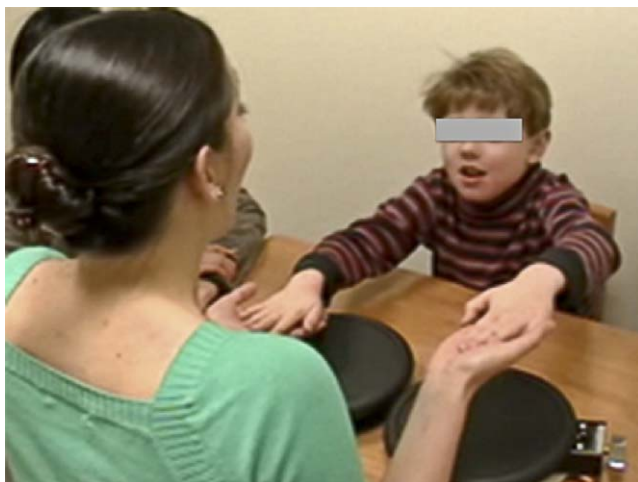
Figure 1. An illustration of an AMMT trial. Therapist guiding a child in the unison production of a target word while tapping the electronic drum pads.

The therapy sessions were conducted in one of the clinical treatment rooms of the Music and Neuroimaging Laboratory at Beth Israel Deaconess Medical Center. During each therapy session, the child was seated facing the therapist (see Fig. 1). A pair of tuned drums was placed between them, with each drum tuned to a fixed pitch (one at C4 or 261.626 Hz, and the other at E b or 311.127 Hz). To establish structure in the treatment environment, each session began with a “Hello Song” and ended with a “Goodbye Song”. The set of 15 items trained during treatment consisted of high-frequency objects, actions, and social words or phrases (e.g., “mommy”, “more please”, “all done”) relevant to the child’s activities of daily living. Using Boardmaker pictures (Mayer-Johnson Inc., Solana Beach, CA, 1997) as visual cues, the therapist introduced the target words or phrases by intoning (singing) the words on two pitches, while simultaneously tapping the drums (on the same two pitches), to facilitate bimanual sound-motor mapping. The child was led from listening, to unison production, to partially-supported production, to immediate