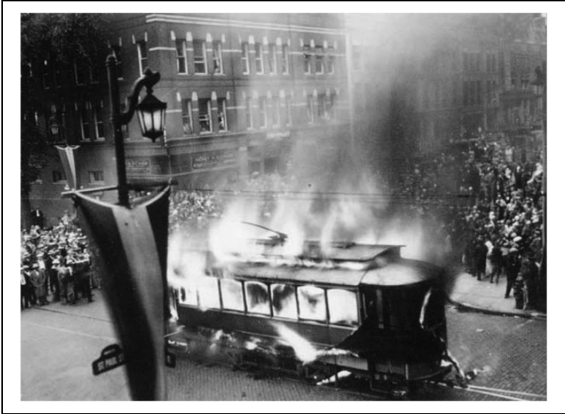
Figure 1. A “funeral pyre” for an Electric Street Trolley in Vermont, 1929.