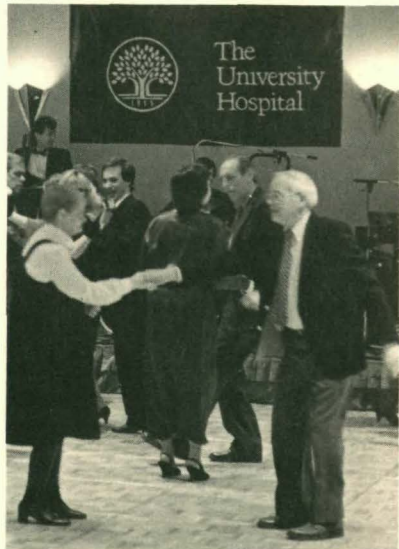
Out on the town-- Hospital employees dance the night away at the recent UH dinner dance. See photo layout inside.

a publication for the people of University Hospital