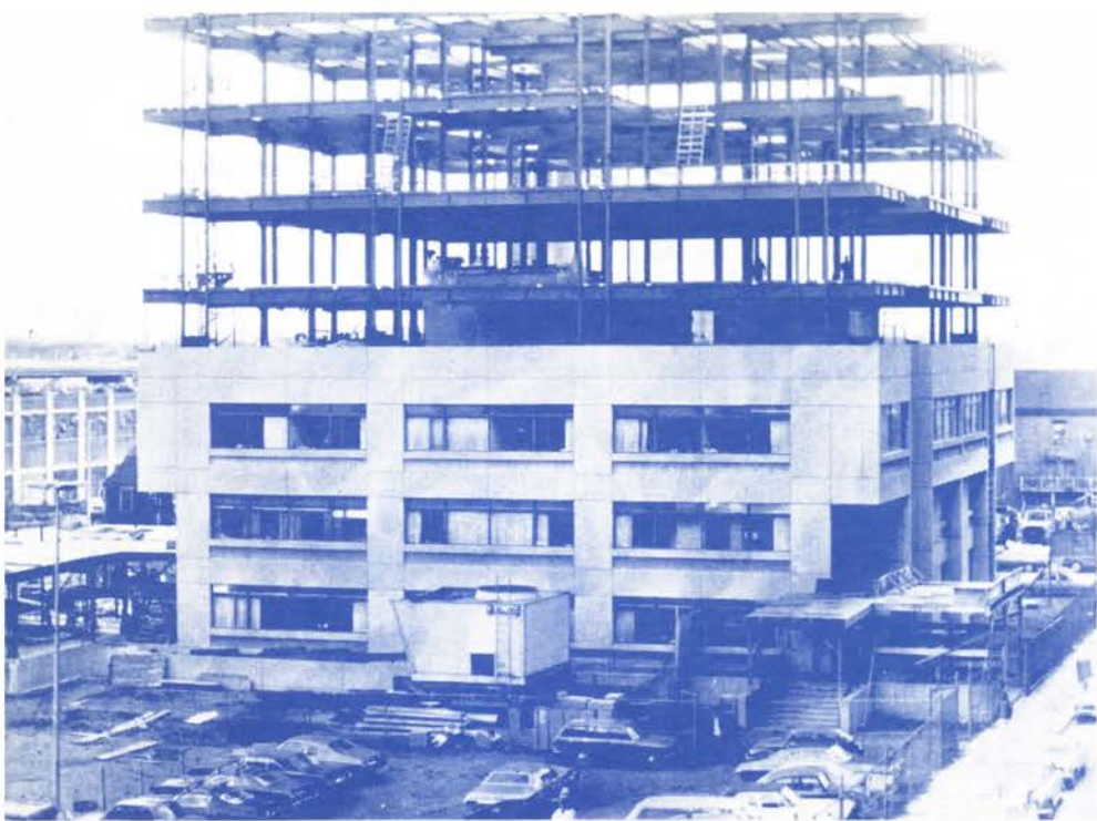
This was the way the building appeared shortly before the end of 1973.