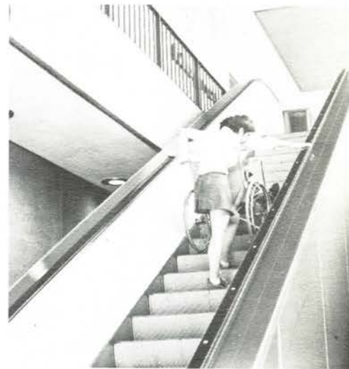
Therapist Edwina Askew and patient