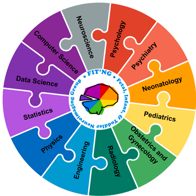
Fig. 2. FIT'NG aims to provide a forum for early childhood neuroimaging researchers, including those who have technical expertise (e.g., engineers, physicists) and applied researchers (e.g., psychologists, psychiatrists, neonatologists).

among developers and appliers is focused around three core areas: establishing best practices within the field (e.g., scan time, staffing, preparatory procedures for scanning, data harmonization); community exchange and collaboration (e.g., sharing processing and analysis tools, sharing data); and education (e.g., training across institutions at a range of levels).