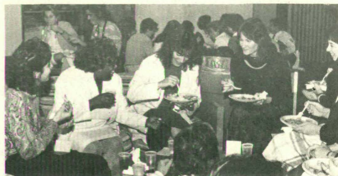
Party time-- Hospital employees gather for food, music and good times at the University Hospital's recent Christmas party.