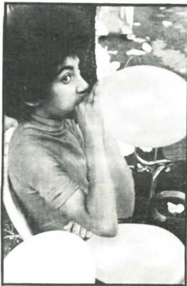
Soul Health Fair, Pg. 3