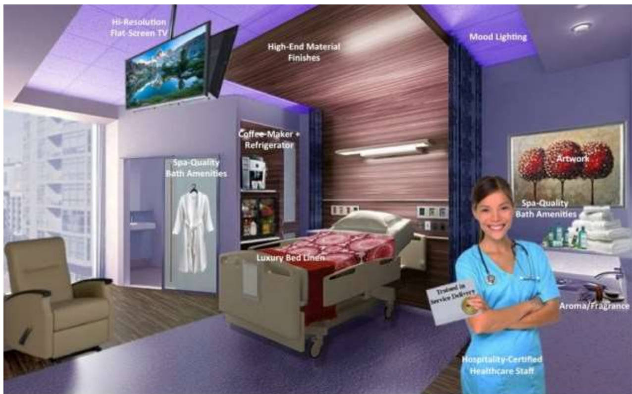
Figure 6. Ideal Hospital Room Representing Maximum Utility.

So what does the ideal hospital room look like, taking into account all of this information? It might appear something like this: