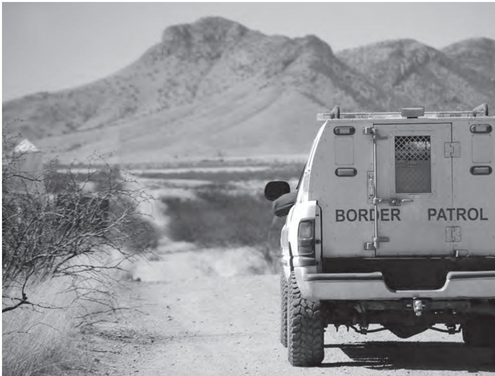
More than 400,000 individuals and family groups were caught trying to enter the United States illegally between ports of entry on the southwest border in fiscal year 2016, according to U.S. Customs and Border Protection.

This article was adapted from a sermon delivered at Boston University’s Marsh Chapel on October 29, 2016.