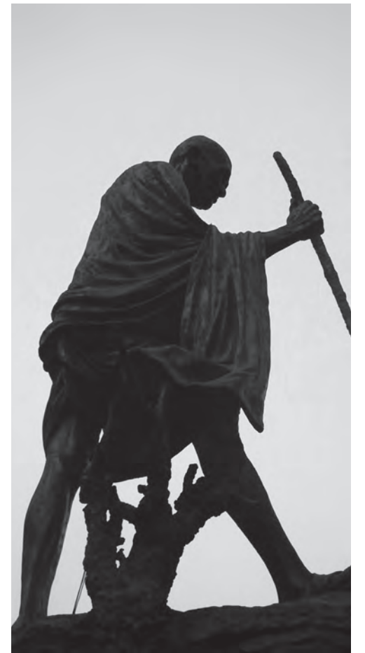
Mahatma Gandhi statue in silhouette, New Delhi

How can we cause the light of compassion and courage to shine on the challenges and conflicts of the world's diversity while waiting for justice? Edith Wharton wrote, "There are two ways of spreading light: to be the candle or the mirror that reflects it." 18 If the world you are seeing is not to your